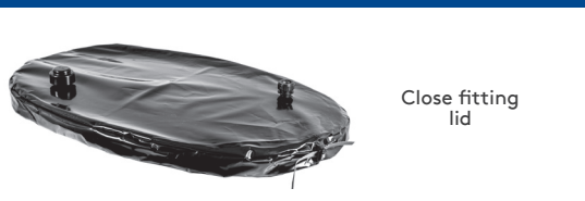
Close fitting lid

To make it easier for the installer and help ensure installation complies with the water regulations, we have updated our range and now supply our most popular cisterns with kits.