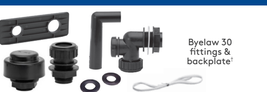
Byelaw 30 fittings & backplate†