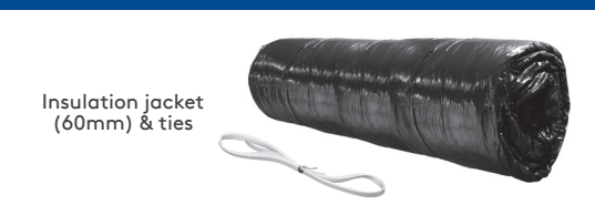
Insulation jacket (60mm) & ties