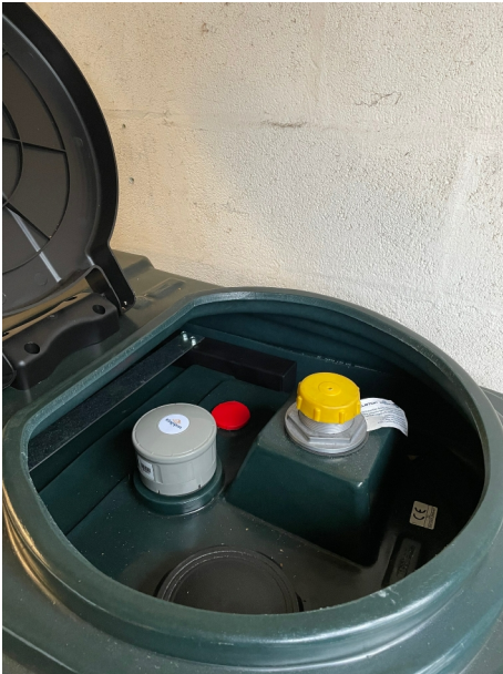
1. Remove the yellow filling cap.