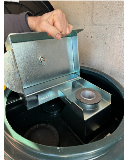
3. Whilst supporting the shield plate, hand tighten the retaining nut in place.