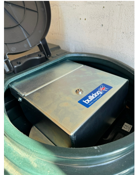
6. Lock the lid in place.