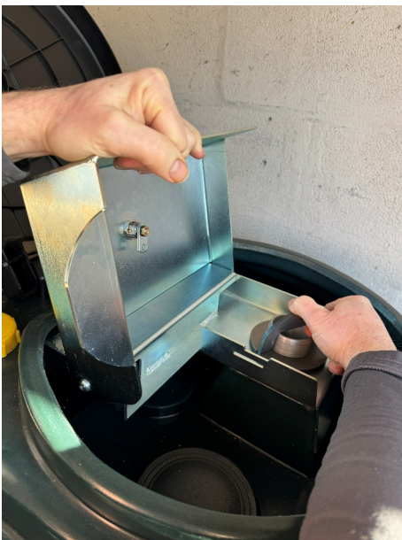
4. Continue to support the shield plate and tighten the nut with the spanner provided.