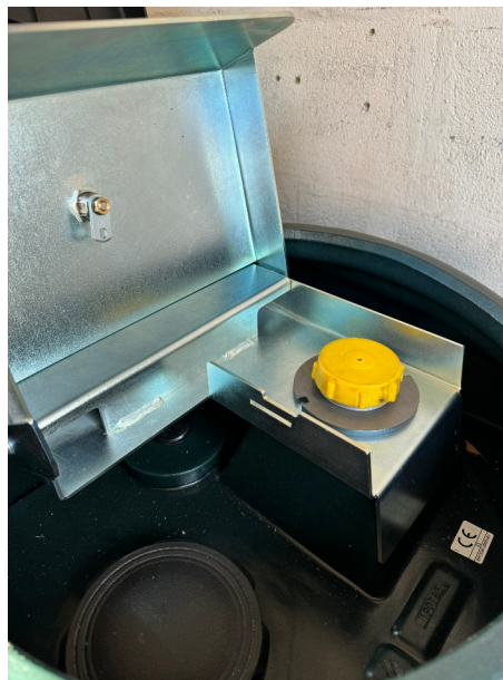
5. Replace the yellow filling cap.